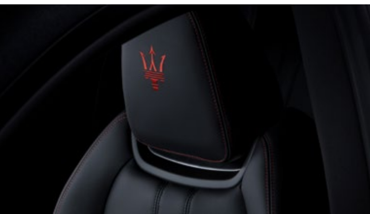
Ghibli - Headrest detail