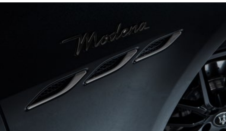
Ghibli - Side air vents and Modena Badge