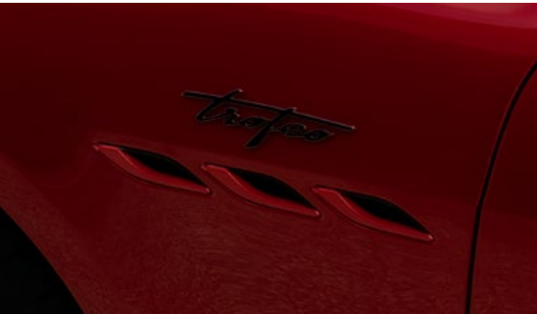
Ghibli Trofeo - Side air vents and Trofeo Badge