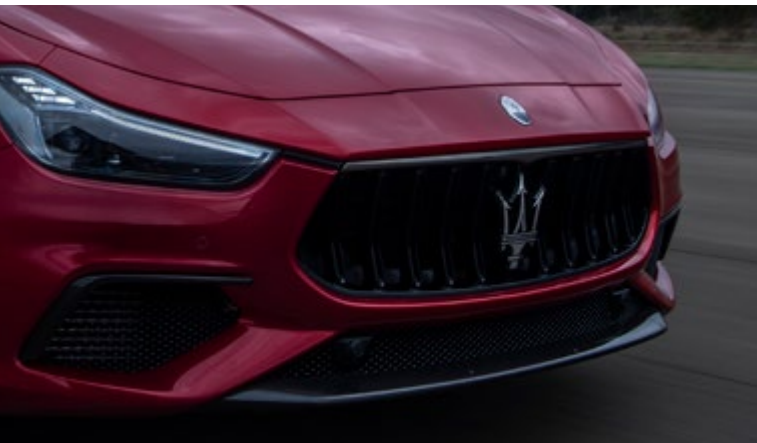
Ghibli Trofeo - Grille

Live audacious. Drive with character. Stand out in just 4.3 seconds with the ultimate Maserati Ghibli Trofeo. With 580 hp and a top speed of 326 km/h, the Trofeo is the most powerful Ghibli ever . Your bold statement that redefines the art of possible. The striking coupé look of the Ghibli, intensified by race-inspired design elements. High-gloss Carbon fibre on the front, the rear and on side air intakes, and the sculpted Trofeo bonnet with air extractors give you just a taste of what awaits as you grab its steering wheel . That's how Ghibli Trofeo came to life. Born from race, enhanced by comfort with an innate sense for timeless beauty.