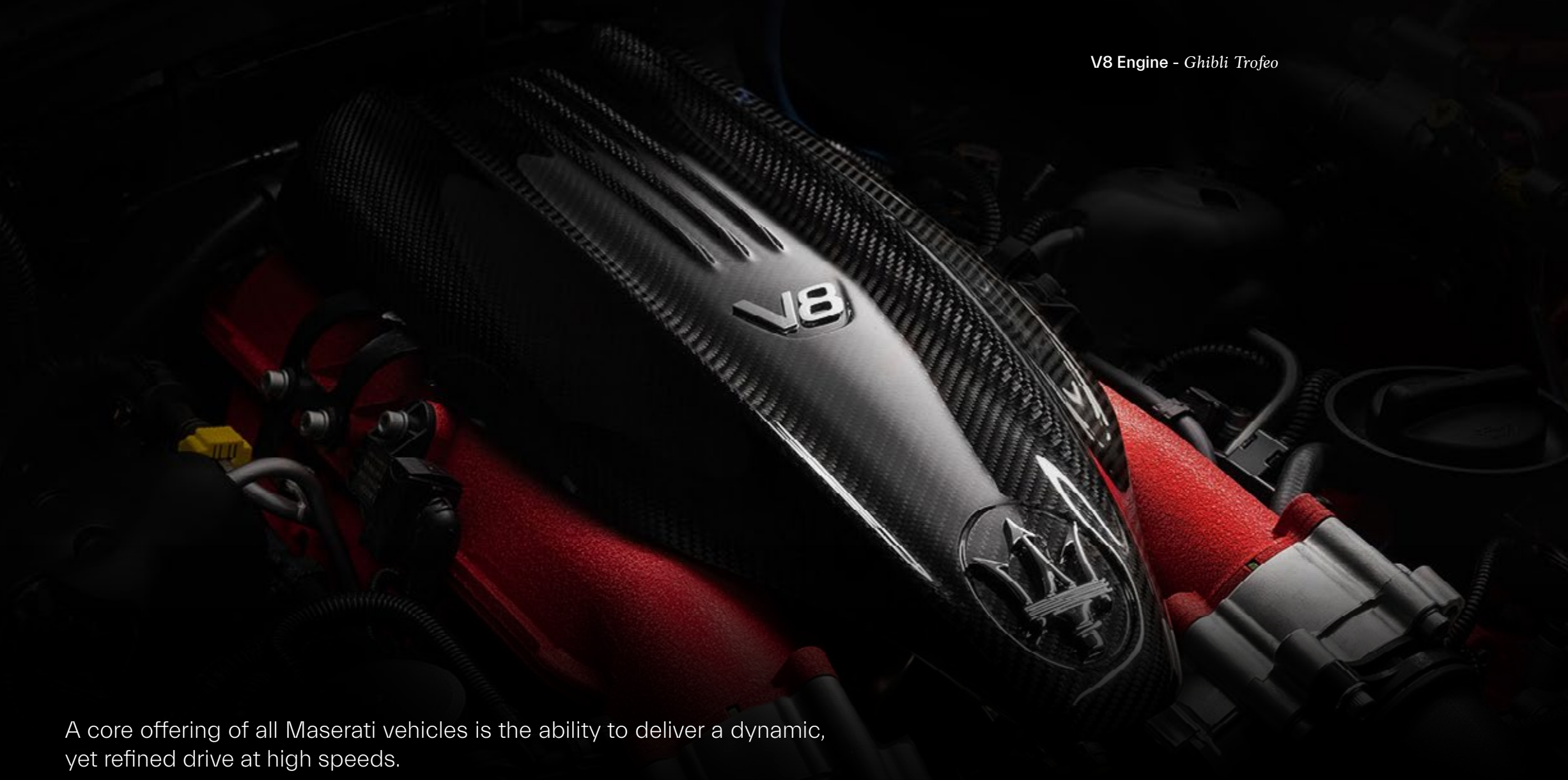
V8 Engine - Ghibli Trofeo