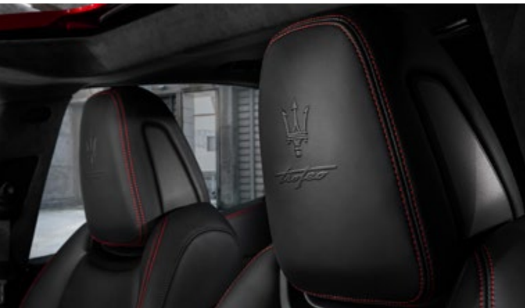
Ghibli Trofeo - Headrest detail