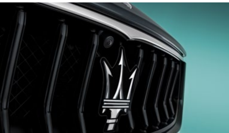
Ghibli - Grille