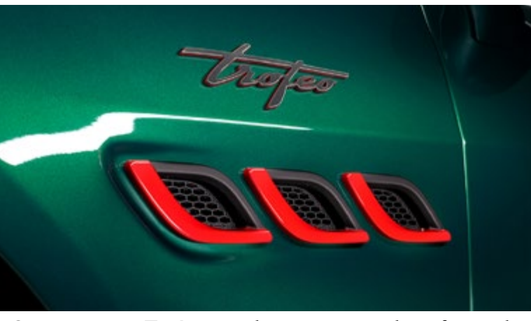
Quattroporte Trofeo - Side air vents and Trofeo Badge