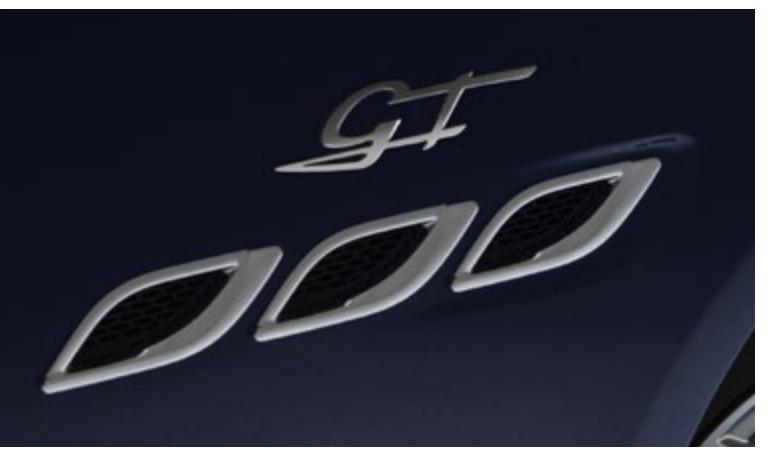
Quattroporte - Side air vents and GT Badge