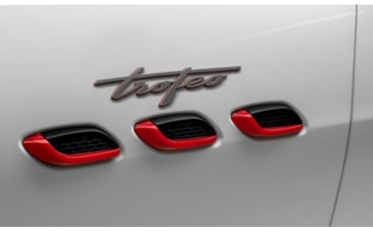
Levante Trofeo - Side air vents and Trofeo Badge