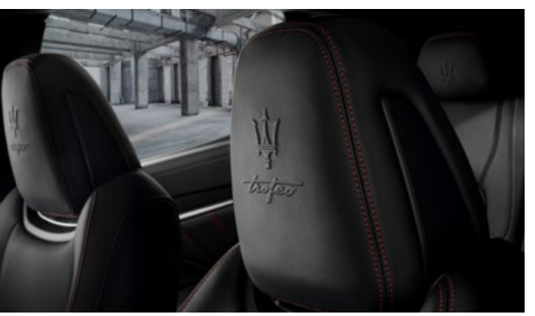
Levante Trofeo - Headrest detail