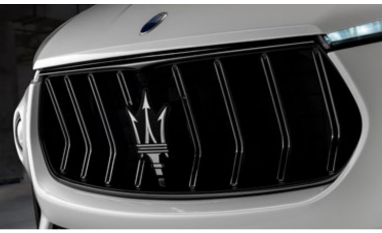
Levante Trofeo - Grille