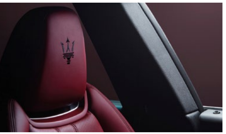
Levante - Headrest detail