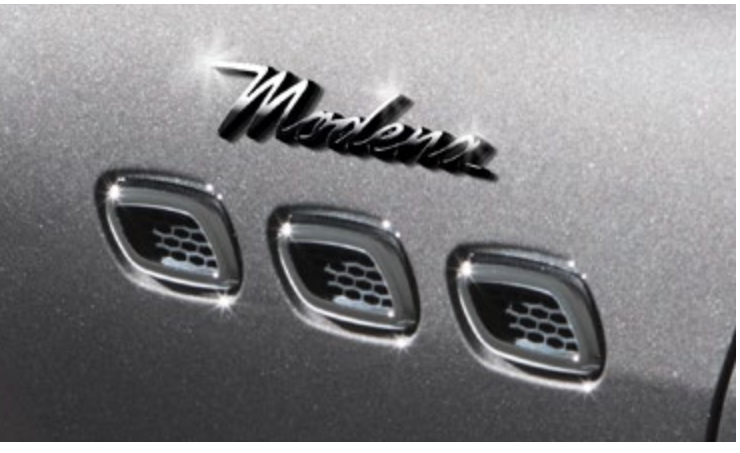
Levante - Side air vents and Modena Badge